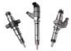
Common Rail Injectors