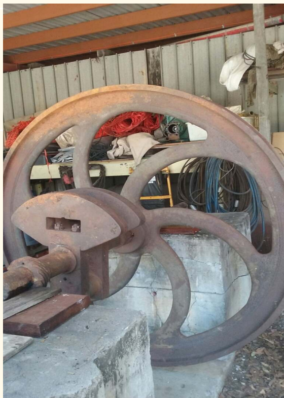
Crankshaft and Flywheel when mounted for restoration on temporary supports at SCRS workshop

Instalment 1/ 'As found' at time of donation.