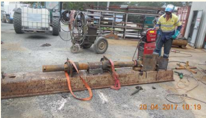
Ready to go