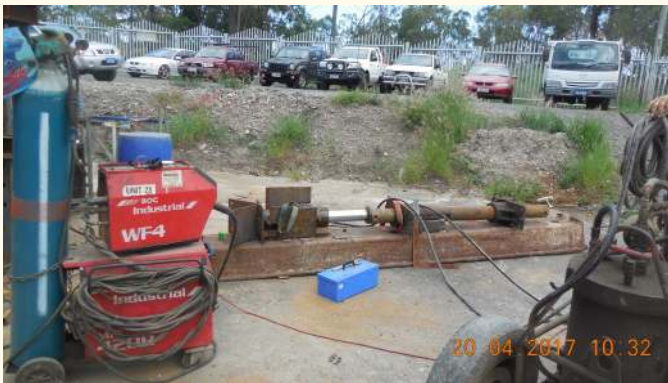
1st Bearing Housing, it's coming off