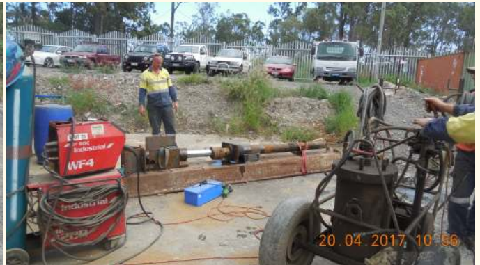
2nd Bearing Housing nearly off