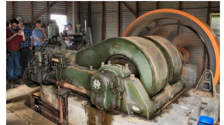
The Engine Still in 'Working Clothes'