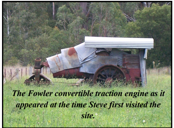
The Fowler convertible traction engine as it appeared at the time Steve first visited the site.

This was the 'tip off' which was passed to Steve, which led to the conversation with Big Al and the subsequent rescue of some very good stuff!