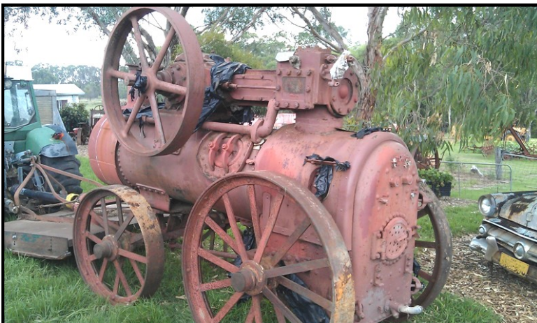
The Brown & May portable, serial number 6668.