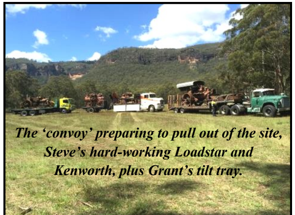
The 'convoy' preparing to pull out of the site, Steve's hard-working Loadstar and Kenworth, plus Grant's tilt tray.