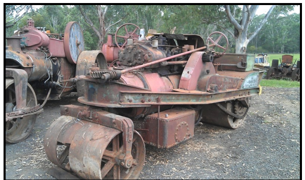
The Robey tandem steam roller, so called because of the two full-width rolls, as compared to the more common three-point (tricycle) steam rollers.