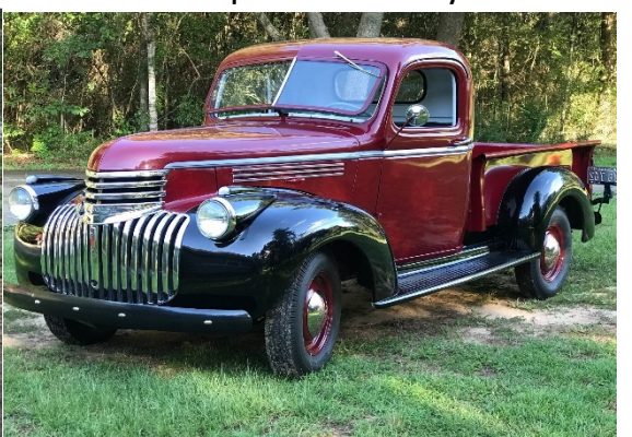
Chevrolet & American Trucks

All Vintage & Classic owners are welcome to register & exhibit