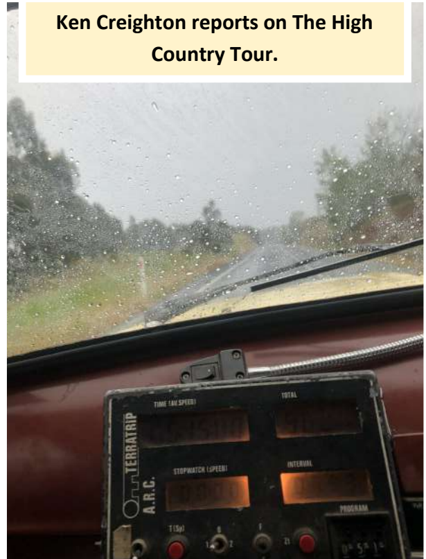
Ken Creighton reports on The High Country Tour.

Ange and I recently participated in the High Country Tour run by the Historic Rally Club of NSW/ACT. The four day tour commenced in Albury, with the group being able to drive wholly on tarmac, or a combination of tarmac and gravel. Each car was issued with rally notes to navigate throughout the day.